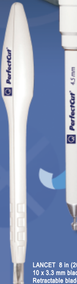
LANCET 8 in (20 cm), 10 x 3.3 mm blade Retractable blade shield